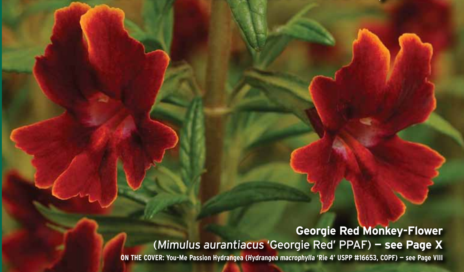
Georgie Red Monkey-Flower

( Mimulus aurantiacus 'Georgie Red' PPAF) – see Page X