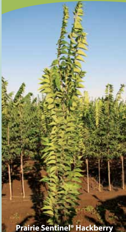
Prairie Sentinel® Hackberry