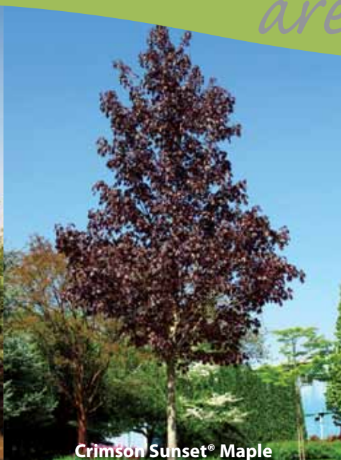
Crimson Sunset® Maple